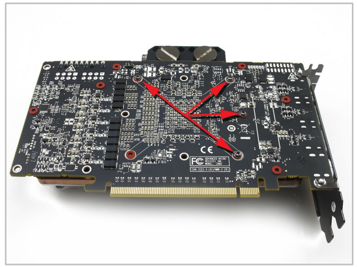
3 . Fit the original screws to the positions marked above. Do not over tighten the screws as this may bend the card and cause permanent damage.

2. Flip the card over (make sure the front thermal pads stay in place). Place the red washers over the screw holes shown above. Now remove the protective film from both sides of the thermal pads. Place the 1.5mm pads in the positions marked in red and the 1mm pads in the positions marked in green.