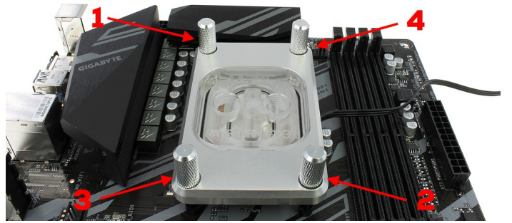
5. Place a nut onto each post and gradually tighten them. You should tighten each nut in stages. e.g. 1,2,3,4,1,2,3,4,1,2,3,4, until each nut is fully tightened.