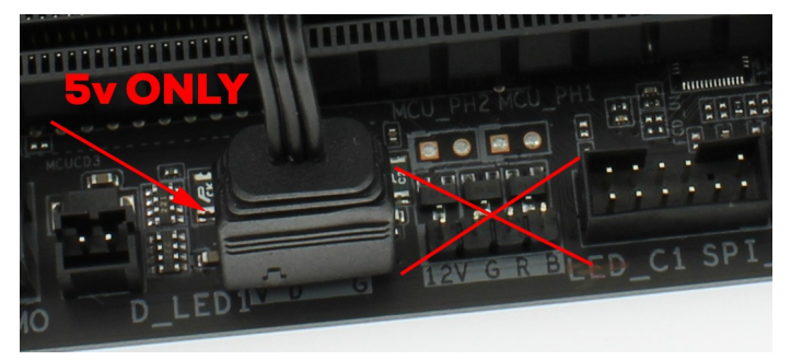
6 . Connect the 5v 3pin aRGB plug to your motherboard RGB header or RGB controller.