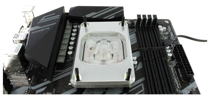
3. Place the waterblock over the posts and onto the CPU.