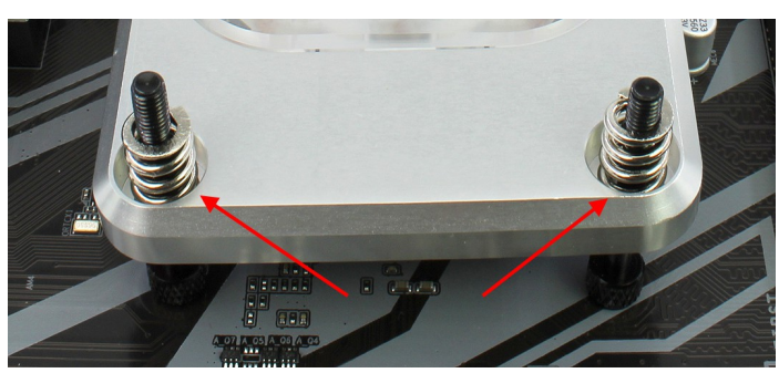
4. Place a spring over each of the four posts and into the wells on the hold down bracket.