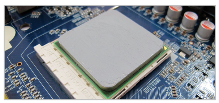
2. Apply a thin layer of thermal paste to the CPUs heat spreader.