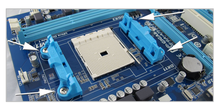
1. Remove the plastic clips on either side of the CPU socket by undoing the 4 screws.