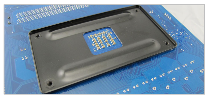
2. If the backplate is loose, place it back in its correct position. Make sure the 4 screw threads on the backplate line up with the holes on the motherboard.