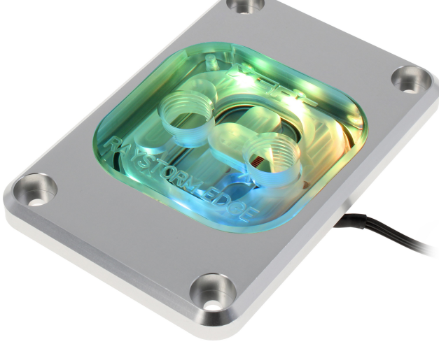
8. The block is now ready to use. When you first boot it is advisable to use software to check the core temperature. If the temperature is high you will need to remount the block.